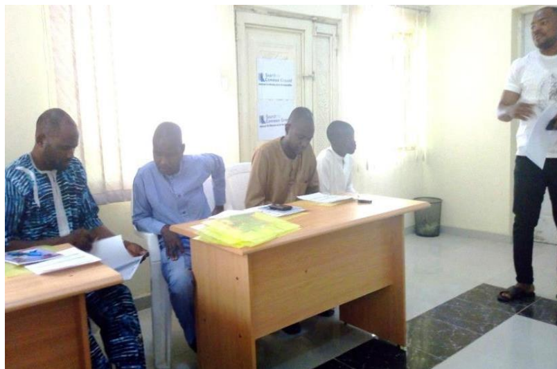
Some of the Peace Club Facilitators at the training

One of the action plans of the Stakeholders for the PAD in Yobe state was the establishment of Peace Clubs in five selected secondary schools 1 in Damaturu. On the 4 th of March the