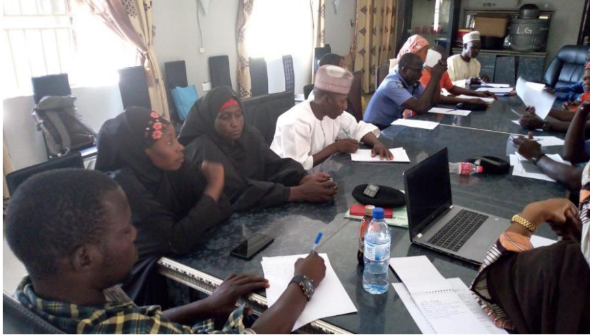
Members at a CSAD Meeting

The Bade CSAD held 4 coordination meetings in 2019. The meetings which held at the government lodge, Gashua have been well attended by the members. The meetings have been to discuss the progress of cases reported to the platform and to entertain new cases reported by the members. A total of 6 cases have been reported by members to the platform. The cases