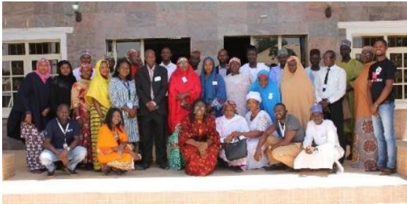
Participants at the Borno Gender Training

This activity was organized for selected formal and informal judicial service providers from Borno (Jere and Mafa LGAs) from the 11 th - 12 th / 14 th - 15 th March 2019 and Yobe (Bade LGA) on the 12 th - 13 th March 2019 States. The training focused on gender, GBV, evidence-based reporting, case management, human rights, and legal and institutional frameworks for preventing and responding to GBV. The 85 participants (40 female, 45 male) who attended the training were