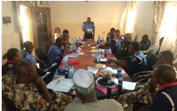
Participants at the training for security personnel

This activity was designed and implemented by the PAD. The activity held on the 14 th March, 2019 and was meant to empower the security actors in Yobe state to mainstream gender in