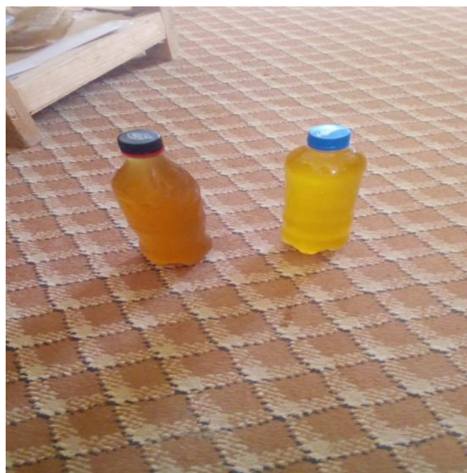
IPT Step down in Bade, Yobe state