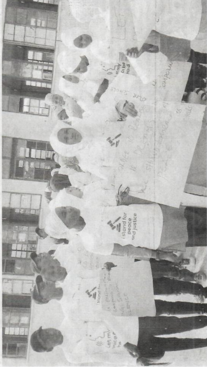
Students at a peace club rally in Damturu