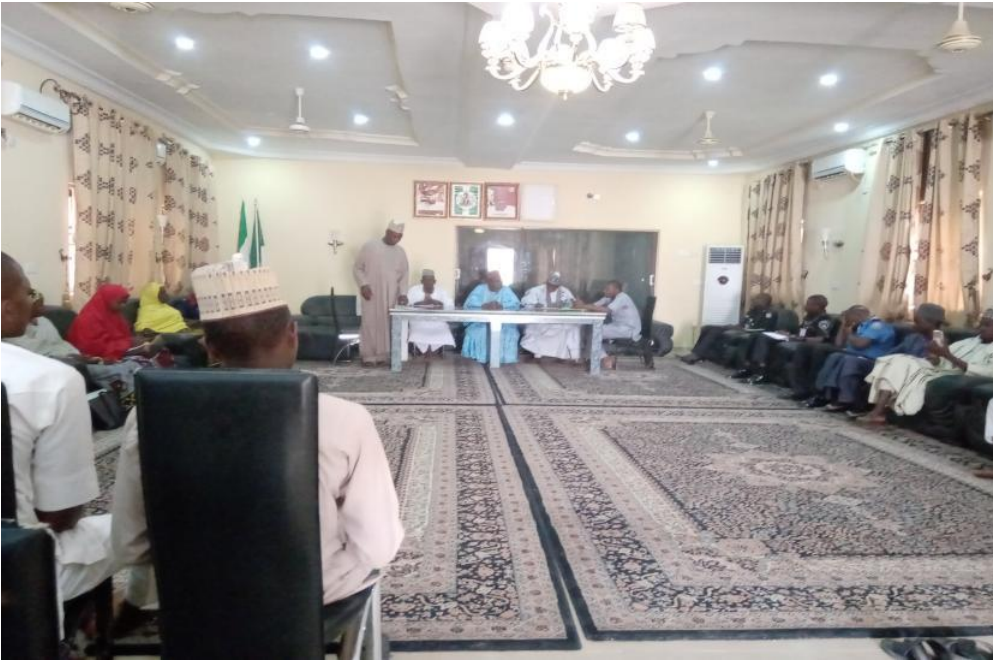
Participants at the meeting

The town hall meeting was the last activity of the CSAD platform. The meeting attracted members of the CSAD platform as well as other traditional leaders and stakeholders. The CSAD Secretary gave an overview of the activities of the CSAD so far according to the action plans drawn on the 26th of November 2018 during the stakeholders' workshop. The facilitator thereafter coordinated the session on collaboration and synergy among stakeholders present and the CSAD platform in addressing cases of GBV in the LGA. He also mentioned the fact that a few of the traditional leaders will be added to the platform to expand it to include other communities represented. The stakeholders consented to collaboration and said it was a good way to address GBV issues. The CSAD members successfully planned and held the town hall meeting which signaled a positive attitude towards sustainability. The membership of the platform was expanded through the meeting incorporating additional traditional leaders. Participants were also able to know the channels through which cases could be reported. The meeting ended