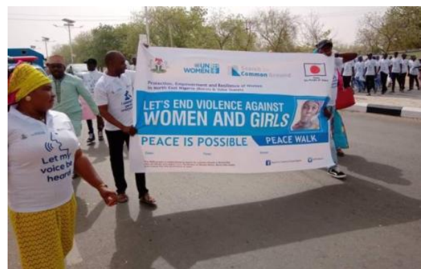
Club facilitators leading the walk and holding the banner

The walk which held on the 18 th March 2019 started at 10:00am from the premises of the Government Girls College, Damaturu. The students and facilitators were all beautifully dressed in the peace club t-shirts and well organized in rows and well guided and began on the steps to the Emir's palace. The students were seen holding different cardboards with write ups that called on supporting women and girls, ending violence against women and embracing peace both within schools' environments and the communities at large. The entourage was ably supported by a band that played different musical tunes which called the attention of everyone in and around the places the students passed