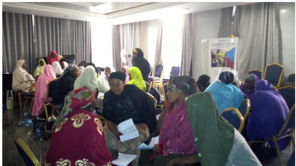
Participants in a group activity

on women in leadership from the religious point of view which helped the participants be at ease to learn. The training content included: leadership, self-esteem, awareness and confidence, advocacy, mediation, mobilization and public speaking. The training was highly interactive and participatory. Participants expressed joy over the new things they learned. Training ended with an action planning session through a group activity.