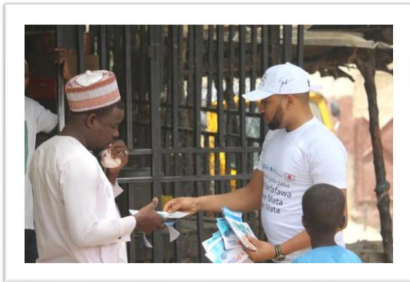
A campaign volunteer giving out flyer and telling the receiver the message on the sticker

ages of 18 – 30 drawn from tertiary institutions and members of the National Youth Service Corps and were given orientation prior to the road show.