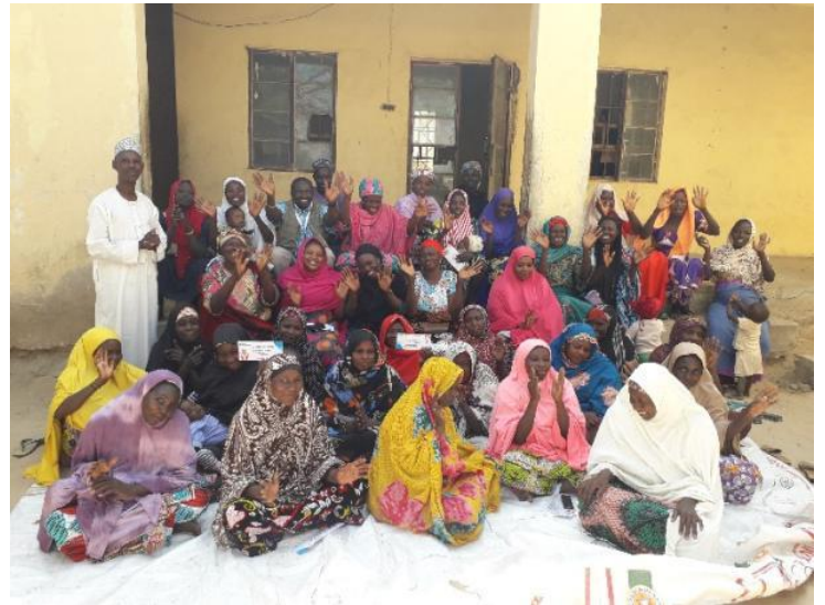
IGA Training in Borno