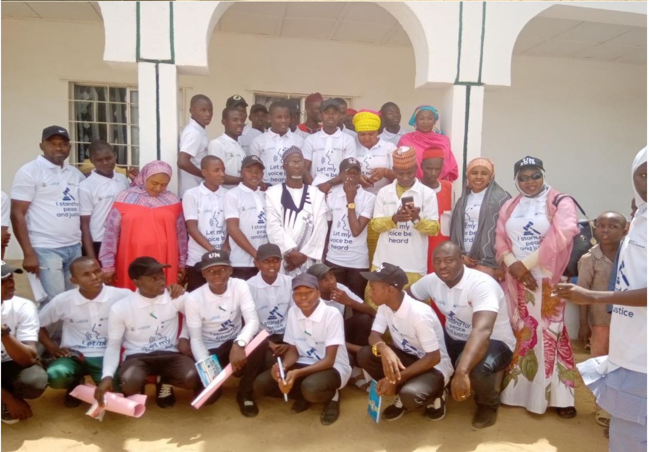
IPT Step Down Training in Borno