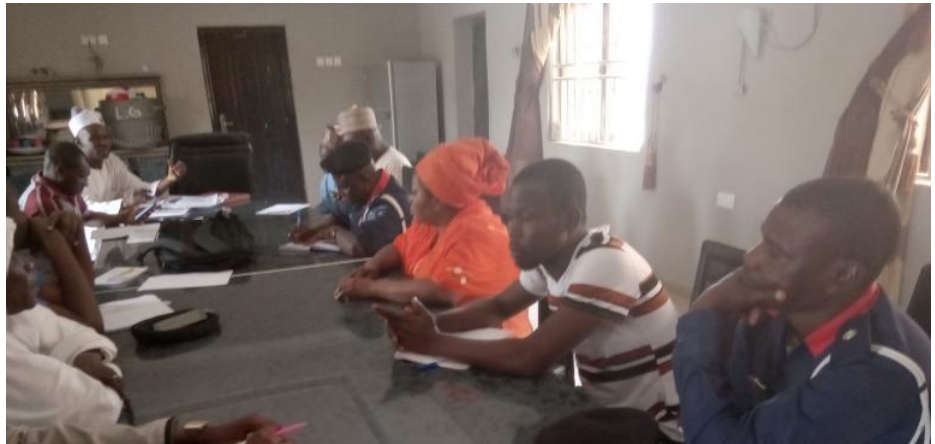
Members at another CSAD Meeting

PERD project was coming to an end. Some of the sustainability items discussed included- opening a bank account for the platform to receive payments/funding for its activities, membership monthly dues collection of N500, appointment of EXCO to run the affairs of the platform (Secretary, Assistant Secretary, PRO and Treasurer). The members agreed that the meetings will always hold at the government lodge and the Emir of Bade, the convener of the platform would be adequately briefed after each meeting. The platform has an active WhatsApp platform for ease of communication.