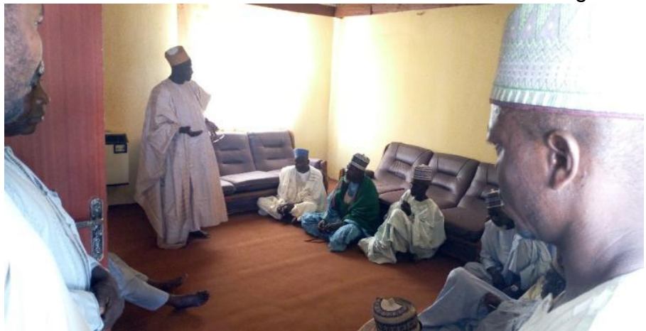
Waziri of Damaturu speaking to the trad. leaders on the issues for advocacy

The PAD carried out advocacy visits to the commandant of NSCDC and media houses on the 29 th of January and to traditional leaders on the 11 th of February, 2019 . The visits were aimed at soliciting support of the stakeholders for the activities of the platform. The visited stakeholders were adequately briefed about the PAD platform and expressed commitment to support the platform. The Commandant of the NSCDC expressed commitment to partner with the platform to achieve its objective. He noted the Search had commissioned him as a gender champion during the HeForShe launch and he was obliged to support the initiative. The General Manager of Yobe Television committed to give PAD 30 minutes airtime on their already existing programs and to also cover the activities of the platform. The General Manager of Yobe Broadcasting Corporation also committed