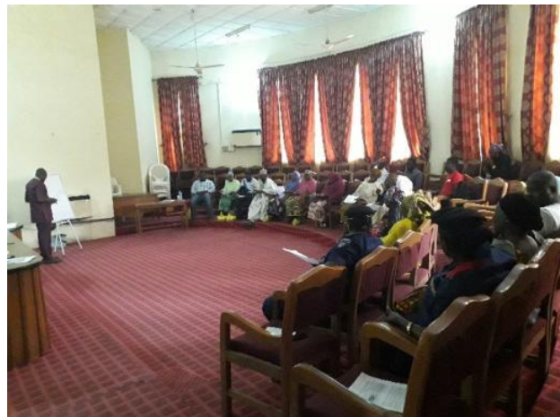
Cross section of participants during the training on Gender Sensitive Early Warning Early Response Training for CSAD Observatory members from Mafa and Jere LGAs