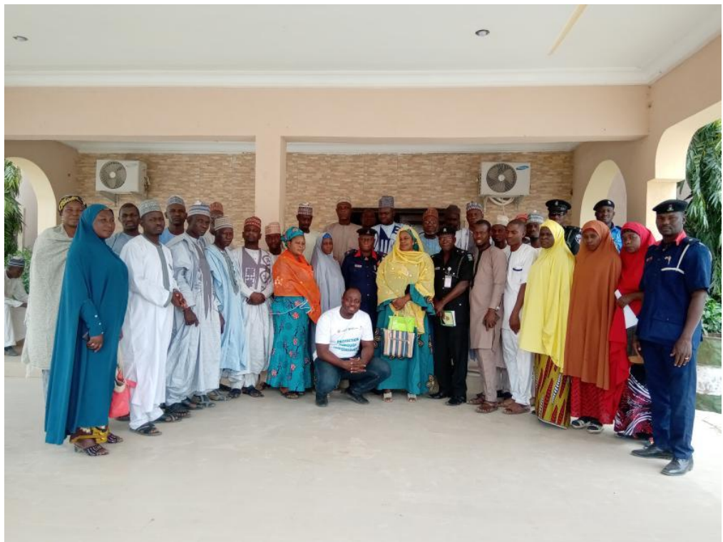
Group photograph of participants at the town hall meeting

also able to know the channels through which cases could be reported. The meeting ended