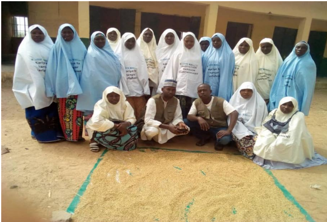
UN Women and Search project team in a group photograph with the IPT Consultant and Yobe Extension Agents during the IPT TOT Training in Yobe