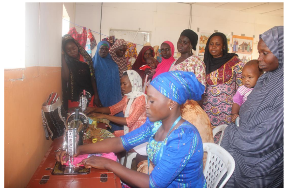
Figure 1 IGA Trainees learning fashion designing in Borno

In Borno state, Search partnered with the State Agency for Mass Literacy to conduct the IGA trainings for women from Jere and Mafa LGAs. In Yobe state, Search worked with the Business Entrepreneurship Skills Training Centre to conduct the trainings. The beneficiaries also were provided with business management classes to enable them to sustain their livelihoods after the training. The business management classes comprised topics to include financial literacy, savings and loans, bookkeeping, and entrepreneurship. The beneficiaries attended these classes three times in a week in both states. The training was aimed at increasing knowledge for women on financial literacy skills and business management and also support for the women to develop business plans for their businesses.