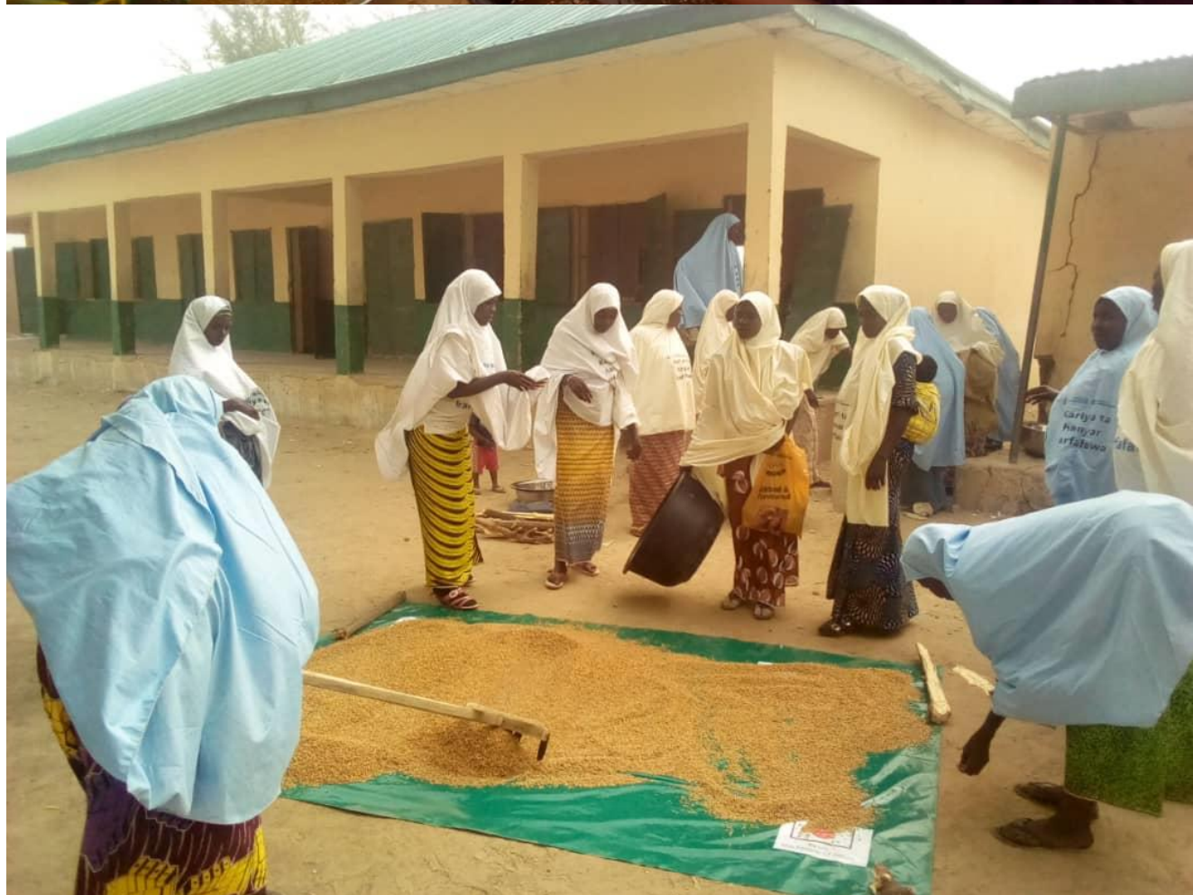
Peace Club Members and Facilitators in a group photograph with the Waziri of Damaturu