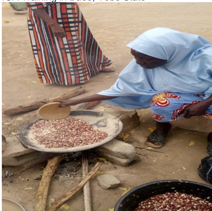
IGA Training in Bade, Yobe State