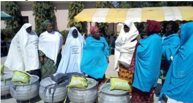
Commissioner MWASD presenting the IPT Kits to the women leaders