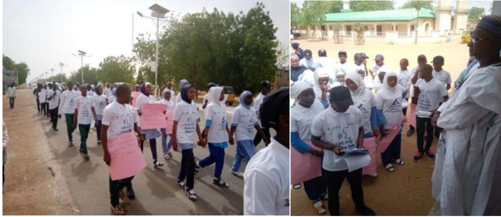
cross section of club members during the walk

through. The team arrived at the palace and was received by the Waziri of Damaturu on behalf of the Emir. Two students made brief presentations on peace and the need for the Emirate to strive to end GBV and violence in Yobe state. The Waziri warmly welcomed the team and committed to ending GBV and fostering peace. He said the Emir recently received an award for peace and so he was committed to fostering peace which is what the clubs represent.