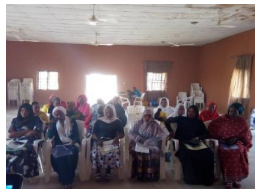
Participants at the training for women on drugs, Yobe state.

This activity was also initiated by the PAD. The training was organized on the 15 th of March 2019 for women and young adolescents who were drug users in different communities within Damaturu. The training was to provide awareness on the impact of drug abuse and substance use and the possible remedies for the menace. Over 20 women were empowered within Damaturu to see the ills of drugs use and substance abuse. These women have accessed counseling and rehabilitation services. The participants now see themselves as vanguards of anti-drug abuse campaigns in their communities so as to reduce women and girls' vulnerability to violations from