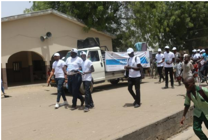
A group of volunteers during the media tour

The activity was used to campaign for and promote women protection/empowerment through the distribution of flyers and stickers and roadside orientation of individuals in Borno and Yobe states.