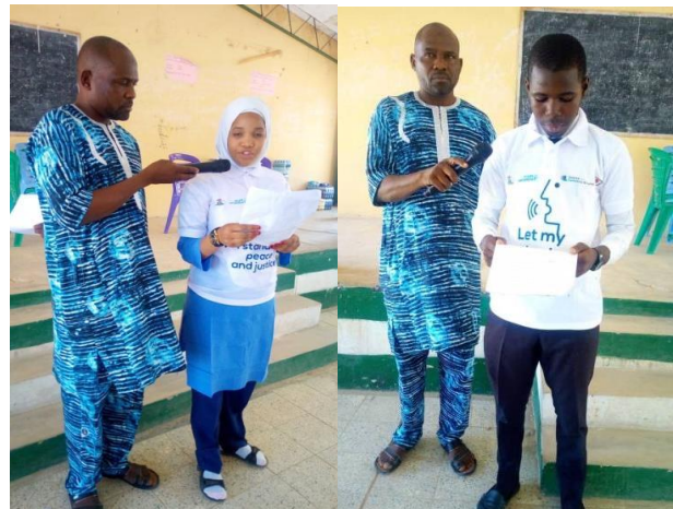
Peace club members making presentations

The Peace Club special program was a joint program held by the five participating schools at the Government Girls Unity College on the 13 th of March 2019 . In attendance were about 150 students . The activity featured drama presentations, paper presentations and poetry. The central messages in the presentations were the need to support the protection of women and girls in schools, homes, communities and the society at large. The benefits of peace were also extolled through the various presentations. The activity helped the club members to understand the issues of peace and gender equality better.