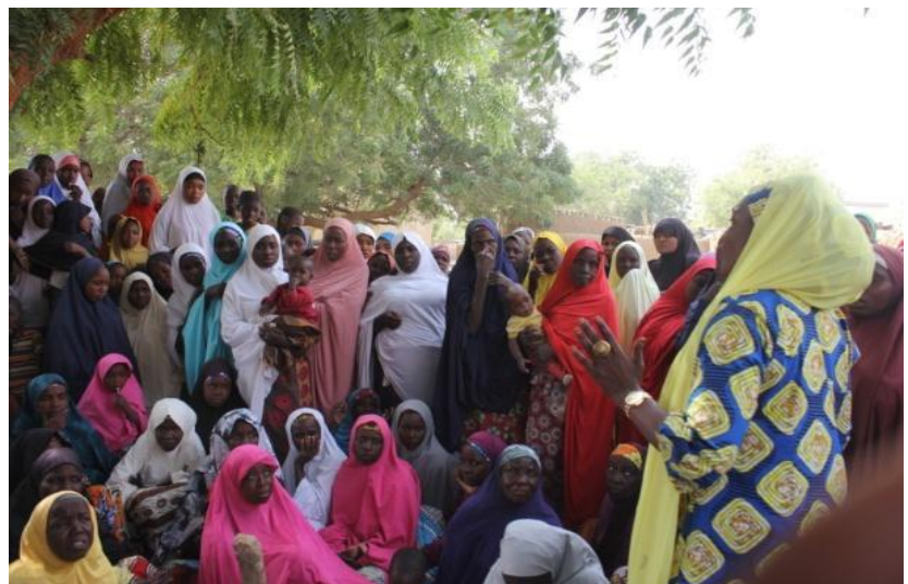
Sensitization to the schols on rape, drug abuse and reporting GBV cases

At the places visited, the facilitators enumerated the effects of drug abuse, street hawking and the need for women and everyone to report GBV cases to appropriate authorities assuring them that cases reported to the CSAD will receive appropriate case management and justice gotten for the survivors of the violence while perpetrators will be equally punished to mitigate future occurrence and rid the society of such people.