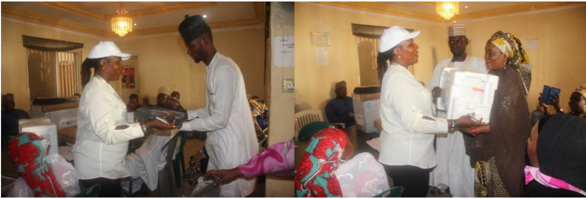
Pictures from the Coordination meeting of the CSAD Observatory platforms in Mafa and Jere LGAs and presentation of equipment to the secretariats of the platforms