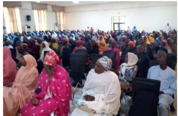
Cross section of participants during the IPT Dissemination workshop in Borno state

The dissemination activities brought together other invited guests and dignitaries who witnessed the women beneficiaries receiving their starter kits to commence rice processing. Notable participants at the Borno launch who witnessed the event included representatives of the Commissioners of Women Affairs, Justice and Agriculture; Traditional leaders of Jere and Mafa LGAs, representative of the Chairman of Mafa LGA, security agencies, religious leaders and the media. Notable dignitaries at the Yobe launch were the Commissioner of Women Affairs alongside two Directors from the ministry, the representative of the Emir of Bade, the Secretary of Bade LGA, religious leaders, and security agencies. Women beneficiaries at the event were encouraged to use the skills gained to better their lives and also empower others. The event provided an opportunity for the women