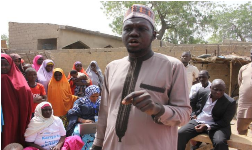
A student asking a question after the sensitization

On the 26 th of November 2018 , a stakeholders' workshop was also held in Bade LGA, Yobe state where the PERD project was introduced to stakeholders in the LGA. The stakeholders at an action planning session also came up with action plans aimed at improving the formal and informal judicial system to increase community engagement on the protection of women and girls in Bade LGA. At the workshop, the CSAD platform was constituted. It is the LGA-level dialogue platform established by Search that seeks to coordinate monthly problem-solving discussions between security actors, civil society, government officials, women and youth groups and key community leaders to focus on coordinated responses to address the identified threats facing primarily women and girls in Bade LGA. Below are the activities implemented by the CSAD as drawn out in the action plan: