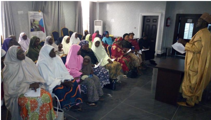
Chief Imam giving welcome remarks on behalf of CSAD