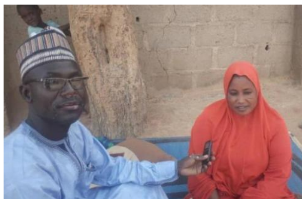
Yobe Radio Producer conducting an interview

Muryoyin yana yiwuwa Testimonials were collected from a good number of key stakeholders in Borno and Yobe states. In Borno state, these included the District Head of Jere, District Head of Mafa, the Secretary to the Chairman of Mafa, members of the NHRC, staff of the MWASD, Bulamas, etc. In Yobe state among others there were representation from the Commissioner of Women Affairs, Village Head of Kukerata, Directors of Women Affairs Commission, FIDA, and other citizens and people of all walks of life.