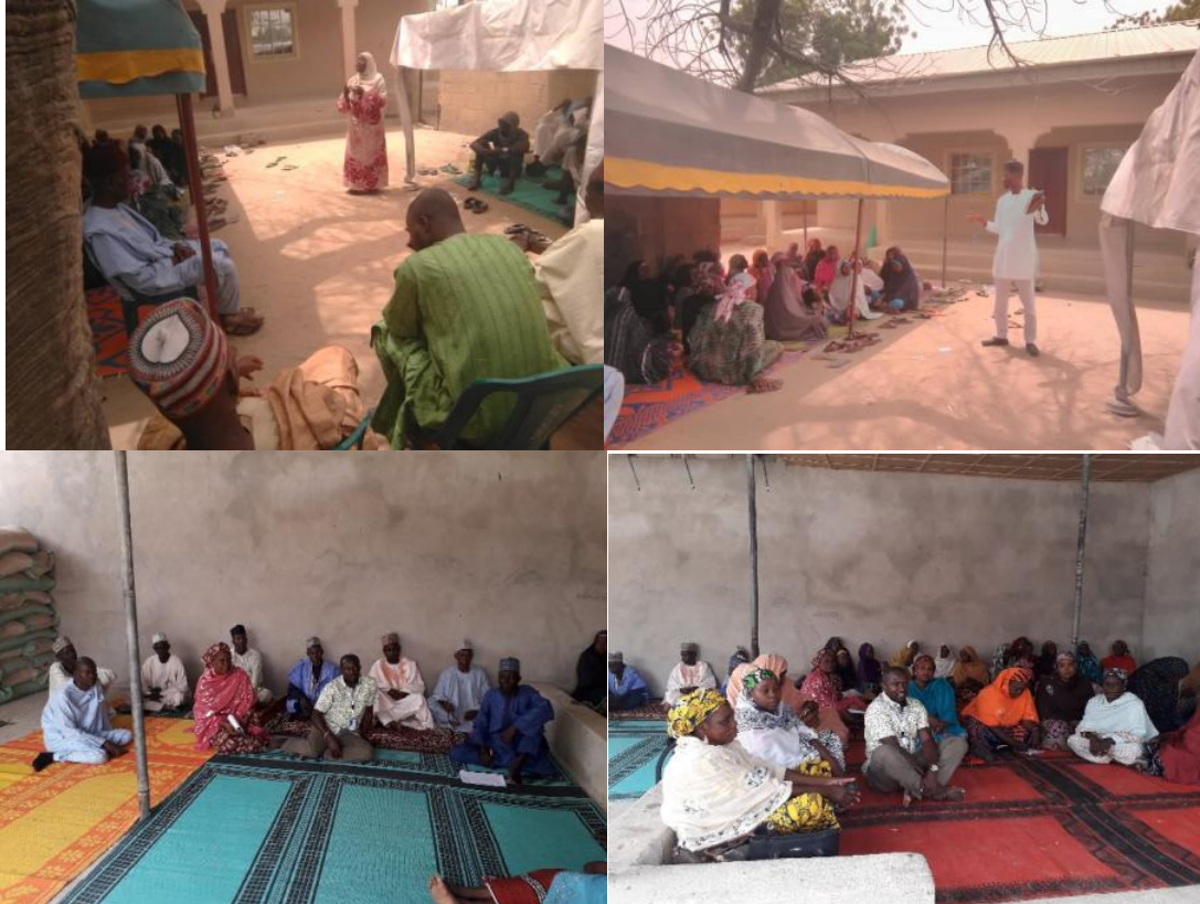
Pictures of participants at the Awareness Dialogues held in both Mafa and Jere LGAs

There were goodwill messages from the Village heads of Mafa Central, religious leaders, the bulama of old Maiduguri and stakeholders present. The facilitators of the activity who are also members of the platform reiterated the need for everyone to collaborate in reducing the cases of GBV in communities and this can only be done if communities and their leaders continuously speak out against such atrocities. Participants present at the training include Community leaders, FIDA, CSOs, traditional/ religious leaders, representatives of Mafa and Jere LGAs.