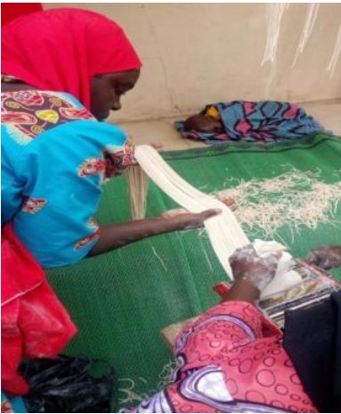
Making of local spaghetti in Bade, Yobe state

One of the major resilience elements under the PERD project is the economic empowerment of women in the two project states of Borno and Yobe. The Training on IGA for women beneficiaries took place in a period of four weeks from February 20 to March 20, 2019 . A total of 399 women, drawn from IDP camps and host communities , participated in the training. They included 99 women from existing cooperatives in Bade LGA of Yobe State, and 180 from IDP camps and 120 from host communities in Mafa and Jere LGAs, with 13 existing cooperatives in Mafa and one in Jere. Those drawn from IDP and host communities without existing cooperatives were grouped in cohorts of 20 women each.