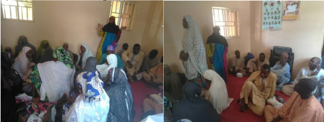
Cross section of women during the legal education activity for women

of Gender Based Violence and also to use the appropriate channels to access justice. The activity will bring about increase in the collaboration between local authorities and formal/informal judicial structures through reports and documentation.