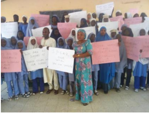
Club members after the peace rally held in GGUC, Damaturu

The sensitization program is one of the action plan activities developed by the peace club facilitators during their training on the 4 th March 2019. The program was aimed at creating awareness on the issues of peace and protection of the rights of women and girls. It was also aimed at promoting women empowerment and ending violence against women. The sensitization programs held colorfully at the different participating schools where students led by their facilitators held rallies within their school premises telling everyone the need for peace and protection of the rights of women and girls. The sensitization held simultaneously in all of the schools on the 7 th of March and started at about 9am.