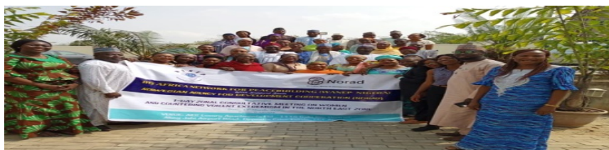
Group Picture of all Participants

the Norwegian Agency for Development Cooperation organized 1-Day Zonal Consultative Meeting to Enhance Women’s Participation in Countering Violent Extremism in the North East on 11 th March, 2020. The meeting aimed to assess the outcomes of the study on the current realities on issues of Women, Peace and Security and implementation of Nigeria’s National Action Plan (NAP) on UNSCR 1325 in the North East.