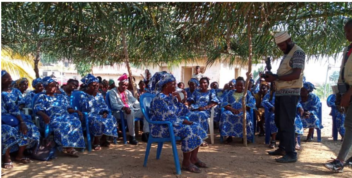
Uneme women during the storytelling for peace programme

WANEPA -Nigeria organized a Storytelling for Peace Forum in Uneme Nekhua, Akoko Edo LGA of Edo State on December 31, 2019. The forum provided the platform for women to tell their stories of peacebuilding while highlighting the challenges faced at community level. The program also provided the space for critical stakeholders to understand the relevant role of women in peacebuilding and build synergies for change and development. Over a hundred community women were in attendance at the program. They promised to make it an annual event to enable them reflect on their peacebuilding efforts and challenges at community level. Some of the lessons from the women’s stories included living in peace requires heeding to simple instructions, loving, sharing and appreciate whatever one have been given by God; Peaceful coexistence eliminates anger and stubbornness from people living in the society; Whoever wants to stay at peace, should not cheat his fellow human being etc.