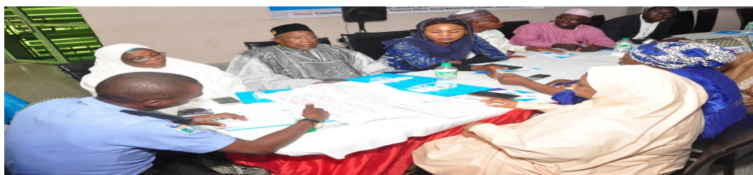
Group work session at the workshop in Gombe

In Gombe State, the workshop which identified key priority areas for the implementation of UNSCR 1325 at the local level was held on January 28- 29, 2019. As part of action to be taken in localizing women, peace and security resolution; it was agreed that mediation trainings be held for women to assist them in mitigating the farmer-herder conflict including holding political parties accountable to their commitment to prevent electoral violence in the state. At the end of the workshop participants made commitments to step down the training and continue in the push towards ensuring Local Action Plans are developed within local government areas for the advancement of the Women, Peace and Security Agenda. A Localization Steering Committee was established at the end of the workshop to ensure developed action plan is implemented by all participants. Presently, Gombe State has a State Action Plan (SAP) and two Local Action Plans (LAPs) in two Local Government Areas.