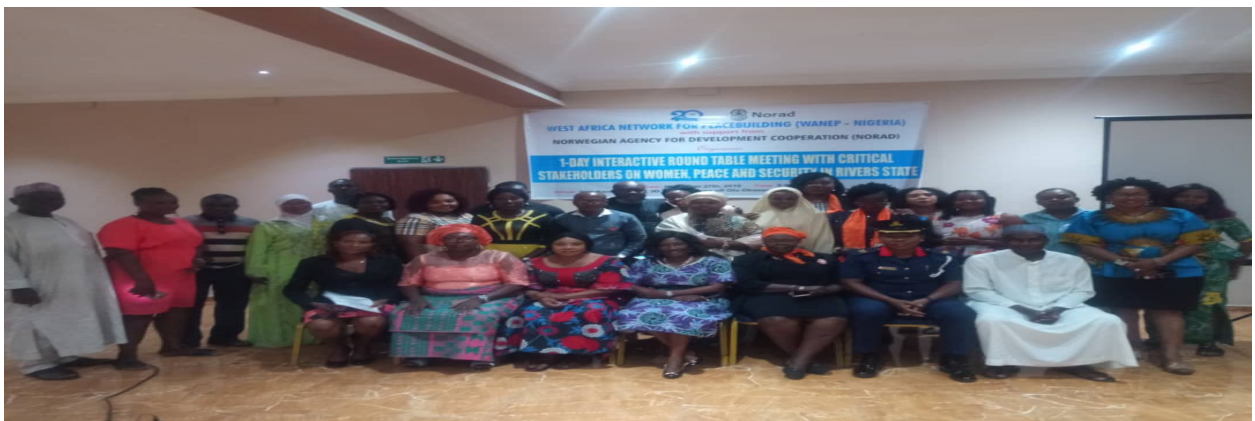
Stakeholders at Rivers State Interactive Roundtable Meeting