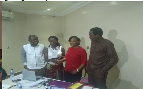
Award Presentation to Outstanding Media Experts