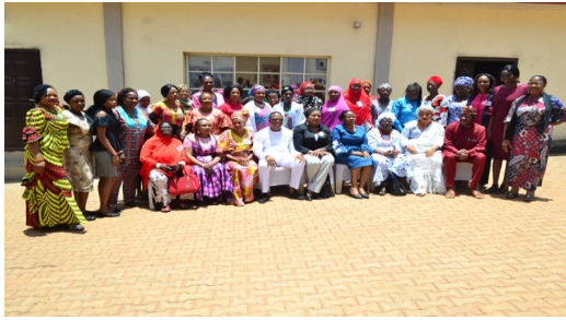
Group Picture of Participants.