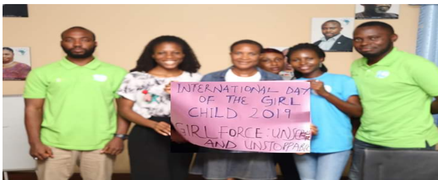
Secretariat members during the campaign

This year, under the theme, “GirlForce: Unscripted and unstoppable” , WANEP- Nigeria celebrate achievements by girls across the globe since the adoption of the Beijing Declaration and Platform for Action. It is noteworthy that in nearly 25 years, more girls move from dreams to actualizing their potentials. More girls are knowledgeable are gaining the skills they need to excel in the future world of work. There is need to continue to educate girls that they can break boundaries and barriers posed by stereotypes and exclusion, including those directed at children with disabilities and those living in marginalized communities. The Campaign which was organized in the WANEP – Nigeria Secretariat drew attention to the many challenges still besieging the girl child in Nigeria.