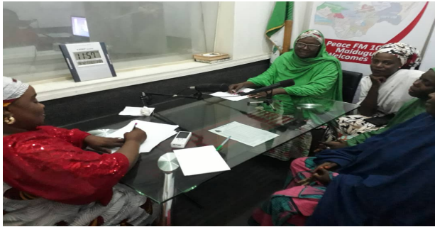
Radio program in session in Peace 102.5 FM- Borno State