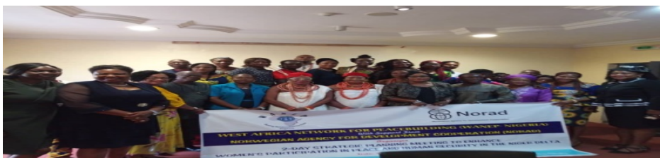
Group Picture of all Participants