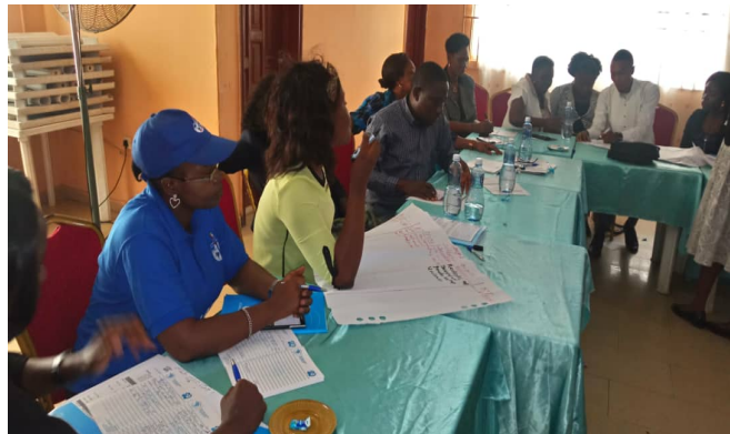
Cross section of participants in Edo State