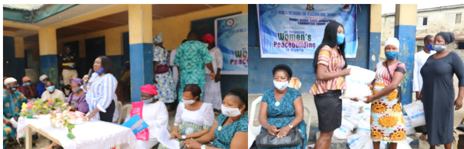
Cross Section Of Guests at the Program

WANEP- Nigeria in collaboration with the Norwegian Agency for Development Cooperation ( NORAD) and the School Based Management Committee ( SBMC) organized a Sensitization forum on Enhancing Participation of Women in Peacebuilding and COVID -19 for women in Agboyi Ketu Riverine Community on September 8, 2020. The meeting aimed to create awareness on what women can do to promote peace at community level and educate them on COVID-19 to prevent the spread of the virus. Food palliative were presented to the women as a way of alleviating the economic hardship faced by the community.