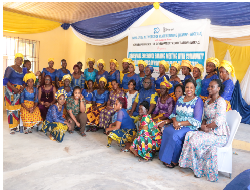
Group Picture of Participants in Ossissa, Delta State

included community leaders, women, men and youth to promote women’s role in peacebuilding. More so, some of the women mobilized members of their communities to protest prevailing farmer-herder conflict in their communities.