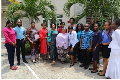
Group Picture of Participants