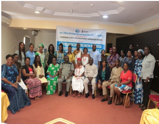
Group picture of stakeholders in Delta State.

The meeting succeeded in strengthening capacities of over 80 key stakeholders in the three states on UNSCR 1325 and its implementation. Commitments were made by key stakeholders to engage trained women who are members of the Women, Peace and Security Network (WPSN) in advancing the implementation of the State Action Plan on UNSCR 1325 in Delta and Rivers States. In Edo State, a technical committee was inaugurated to use the strategies identified by the participants to develop a draft State Action Plan on UNSCR 1325. The interactive roundtable meeting also recorded pledged support of the Rivers states Ministry of Women Affairs and Social Development to localize the UNSCR 1325 in the state. Additionally, existing female peace structures were identified in the states in order to ensure they are further strengthened.