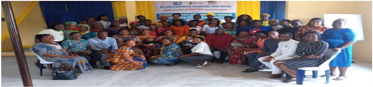
Group picture of participants at the peace and confidence building training in Delta State.