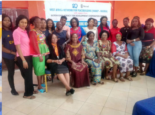
Participants in Ogoni, Rivers State