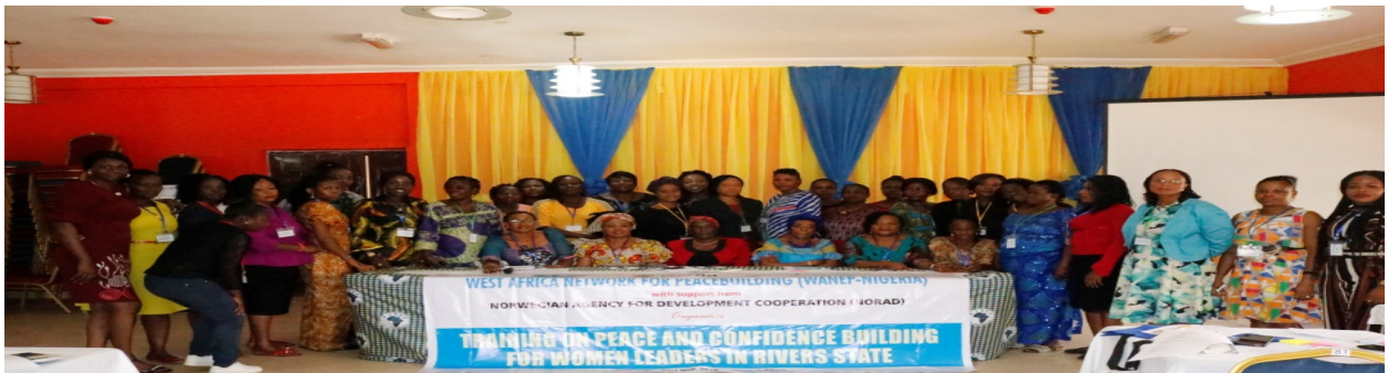
Group picture of participants at the peace and confidence building training in Rivers State