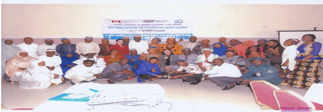
Group picture of participants at the Bauchi localization workshop