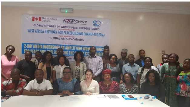
Group Picture of Participants at the Media Workshop

One of the challenges that have been identified in the effective implementation of the UNSCR 1325 since its adoption in Nigeria is low level of awareness, and even though one of the main pillars of the resolution is promotion, awareness on the resolutions remains low. In view of this, the West Africa Network for Peacebuilding in partnership with Global Network of Women Peacebuilders (GNWP) and with support from Global Affairs Canada organized 2- day media workshop on Amplifying Women’s voices for Peace and Implementing the UNSCR 1325 on February 4-5, 2019 in Abuja. The main objective of the workshop was to raise the awareness on the Women, Peace and Security (WPS) Agenda amongst national and local journalists and media practitioners’. It also aims to increase their capacity to report on the implementation of the WPS agenda in an engaging way while contributing to its implementation. One key outcome of the workshop was availability of a crop of media experts who are knowledgeable on the National Action Plan (NAP) on UNSCR 1325 and able to engage in identifying possible strategies to report on Women Peace and Security issues in Nigeria. A media strategy document was presented which include participants’ commitment, thereby, providing a roadmap for participants to advance the concerns and activities of women within their communities as well as raise basic awareness of UNSCR 1325 among the general public.