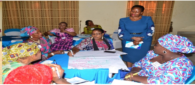
Cross Section of Participants at the Edo Workshop