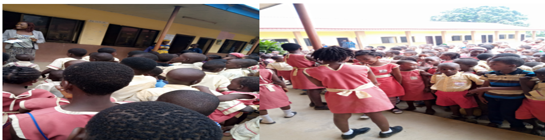
Pupils at Anthony Model Pry School Kosofe LGA, Lagos State

Also, a talk session was held with pupils of Anthony Model Primary School, Anthony Village, Lagos State on December 6, 2019 as part of activities to commemorate the 16 days campaign. The main objective of the sensitization was to enlighten the pupils on the harmful effects of rape on women and girls and arouse the consciousness of boys on their role allies to end this menace in the society. The pupils were encouraged to always speak out whenever they were being molested by anybody either family members or strangers. They were encouraged to confide in their teachers in school and never agree to any form of threat by the perpetrators. The sensitization exercise was timely as the pupils were to go on vacation the next day and some would be visiting extended families to celebrate the festive season.