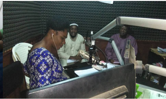
Edo State Broadcasting 95.7FM