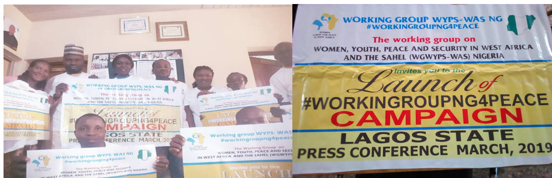
Secretariat Members during the campaign

Also, WANEP-Nigeria on 8 th March, 2019 launched the programme titled: “The working group on Women, Youth, Peace and Security in West Africa and the Sahel (WGWYPS-WAS) in Lagos State. The programme which held at the WANEP-Nigeria secretariat Lagos coincided with the commemoration of the International Women’s Day. In attendance were members of staff WANEP-Nigeria and South West Network members clad in T-shirts with the inscription “Working Group for Peace”. The programme was launched with campaign hash tag: #workinggroupng4peace on social Media. Prior to the launching of the programme in Lagos State, the UNOWAS already launched the Nigerian working group in December of 2016. The campaign aims to strategically sensitize Nigerians on the need for peaceful elections and transition and contribute to the dissemination of the Nigeria National Action Plan (NAP) on the implementation of UNSC Resolution 1325 (2017 – 2020). Advocate for the inclusion and support for the rights of women, children, the aged, young persons, men and persons living with disability as well as actively promote full participation of women and youth in formal and informal peace initiatives.